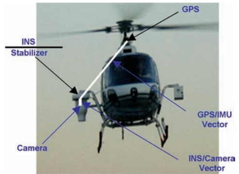
Fig. 2: System configuration of the TLS system.