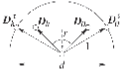
Fig. 3: Enforcing the Plücker constraint onto a 6-vector \mathbf{L}^r = [\mathbf{L}_h^r; \mathbf{L}_0^r] . Starting from vectors \mathbf{D}_h^r = \mathbf{N}(\mathbf{L}_h^r) and \mathbf{D}_0^r = \mathbf{N}(\mathbf{L}_0^r) , which in general are not perpendicular, we easily can enforce the perpendicularity by symmetric linear interpolation, leading to \mathbf{D}_h and \mathbf{D}_0 , which are perpendicular. The vector \mathbf{M} = \mathbf{N}([\mathbf{L}_h | \mathbf{D}_h; | \mathbf{L}_0 | \mathbf{D}_0]) yields a valid Plücker vector close to \mathbf{L}^r .