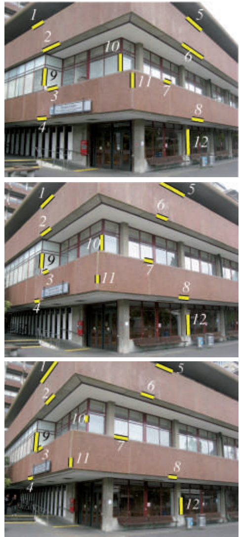
Fig. 4: Three images with 12 corresponding straight line segments used for the reconstruction of the 3D lines, forming three groups [1...4], [5...8], [9...12] for three main directions.

We achieved the following results. First, the square roots \hat{\sigma}_0 of the estimated variance factors \hat{\sigma}_0^2 = \Omega/(G-U) range between 0.03 and 3.2. As the degrees of freedom for each 3D line estimation is G-U = 2I-4 = 2 \cdot 3-4 = 2 , thus in this case is very low, such a spread is to be expected. The mean value for the 12 variance factors is 1.1, which confirms the model to fit to the data.