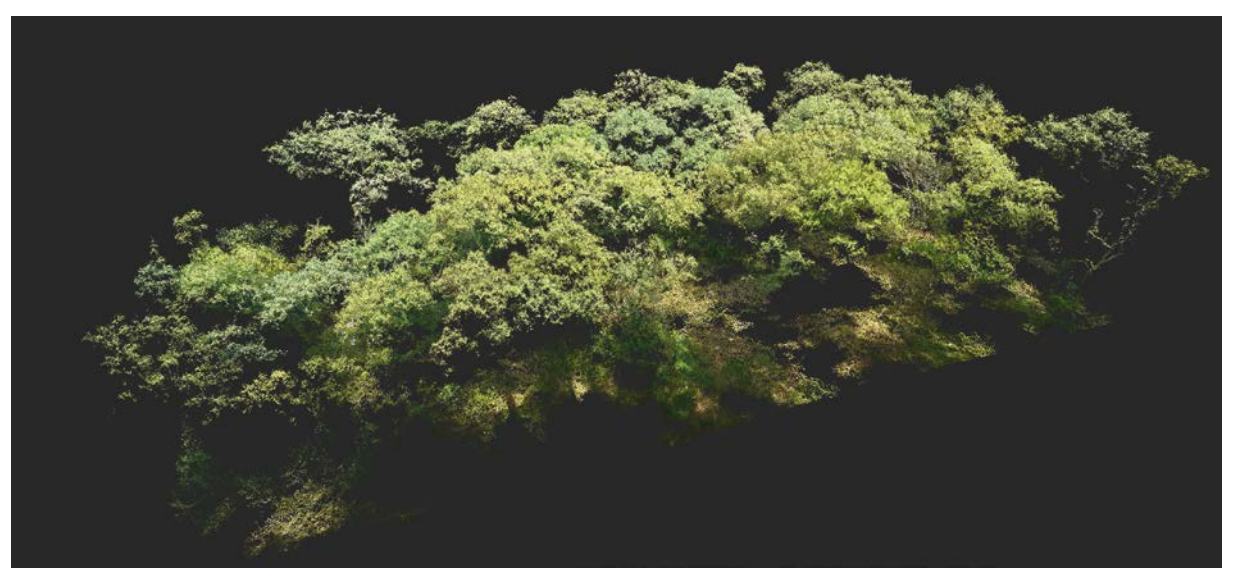
Fig. 1: 3img point cloud of deciduous forest site

The reference data for both sites was acquired by Terrestrial Laser Scanning (TLS). After tie point based co-referencing the TLS and UAV point clouds, the tree positions were extracted from the TLS data, by cutting out 20cm thick horizontal slices from the LiDAR point cloud, and selecting a minimum of 5 points of round shapes, resembling the tree stems. A circle was fitted to the selected points, using the least squares method. The circle center coordinates were listed in a table, to which the height information was added, by visually interpreting the registered UAV point cloud, selecting the highest point from the corresponding tree crowns above the extracted tree positions.